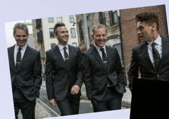
THE MIDTOWN MEN